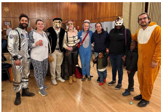
TBI NextGen at our Purim Palooza Celebration